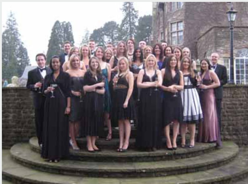
The Resources Group UK team, Pennyhill Park 14th December 2007